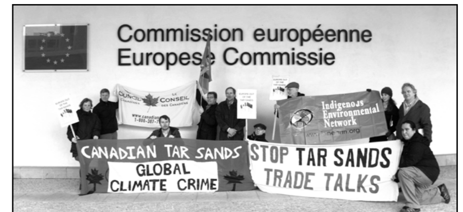
Groups protest outside the CETA talks to voice concerns about tar sands - the privatisation of public services, water, agriculture, corporate power and democracy.

In the hands of a more environmental steward this might not seem such a bad thing. But the Canadian government has already proved its willingness to use trade tools to undermine effective climate policy abroad.