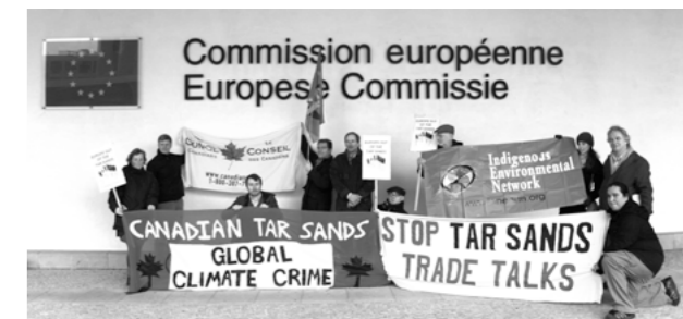
Groups protest outside the CETA talks to voice concerns about tar sands, the privatisation of public services, water, agriculture, corporate power and democracy.

Additionally, the Duncan's and Horse Lake First Nations have been granted intervenor status in an ongoing Supreme Court case, which could have broad impacts on how approvals are granted by the National Energy Board and Alberta's Energy Resources Conservation Board. The case will determine if these tribunals are required to ensure consultation and accommodation of First Nations before declaring a project 'in the public interest'.