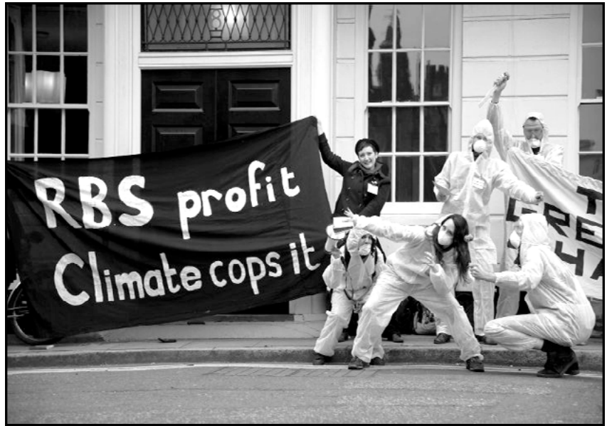
Activists protesting RBS's sponsorship of Climate Week

Friends of the Earth Scotland: www.foe-scotland.org.uk