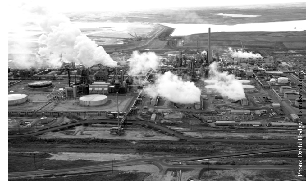
Mining site and upgrader in Alberta.

Tar sands financing not only presents ethical concerns, it also poses financial risk. In 2009, insurance company Swiss Re predicted a sharp rise in litigation resulting from climate change and environmental degradation. The report predicts, '...climate change-related litigation could become a significant issue within the next couple of years.' 15 Indeed, First Nations in Canada have mounted four lawsuits related to tar sands projects. If successful, the cases will radically reform operations in the tar sands, potentially shutting entire operations down until environmental and human rights concerns have been effectively addressed.