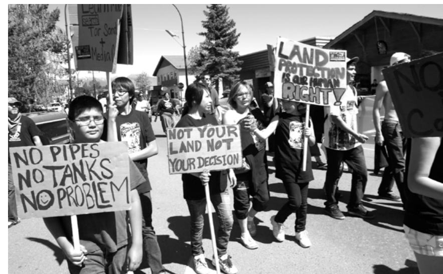
First Nations children and youth march with the Unistoten Clan of the Wet'suwet'en Nation during a protest against the proposed Enbridge Northern Gateway Pipeline in Smithers, British Columbia July, 2010.

The government of Alberta has traditionally held little regard for consulting Aboriginal peoples on development projects. Currently, there are two ongoing lawsuits launched by First Nations that could substantively impact the ability of the Alberta government to grant approvals for tar sands projects.